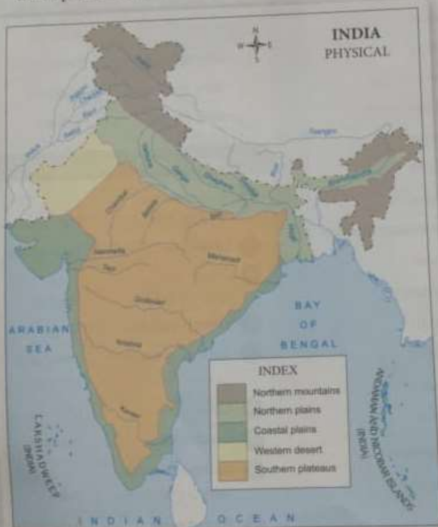
Map 1.3 This is a physical map of India. It shows landforms.