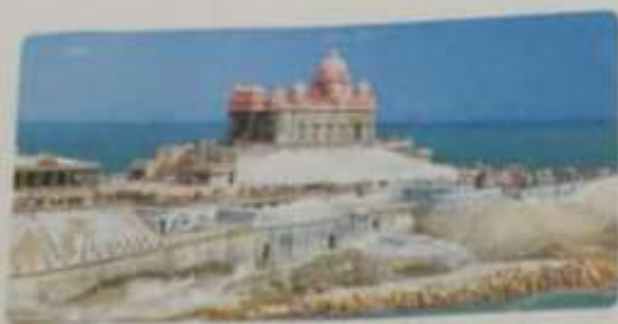
This is the famous Vivekananda Rock Memorial at Kanniyakumari (Tamil Nadu).

mainland of India. However, the southernmost tip of the country is