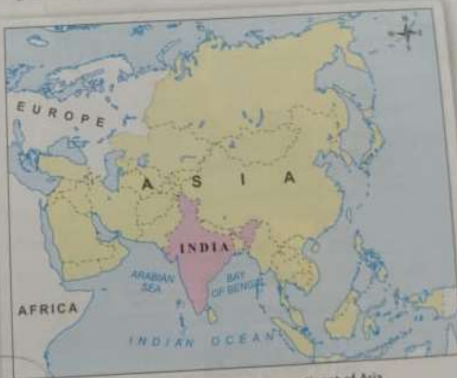
Map 1.1 India is located in the continent of Asia.

*For detailed instructions, see inside front cover.