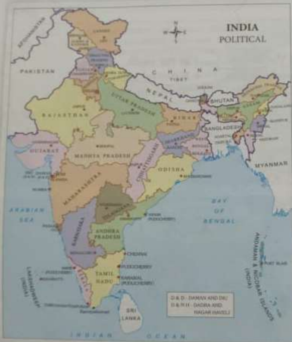
Map 1.2 This is a political map of India. It shows the states and the Union Territories.

mainland of India. However, the southernmost tip of the country is